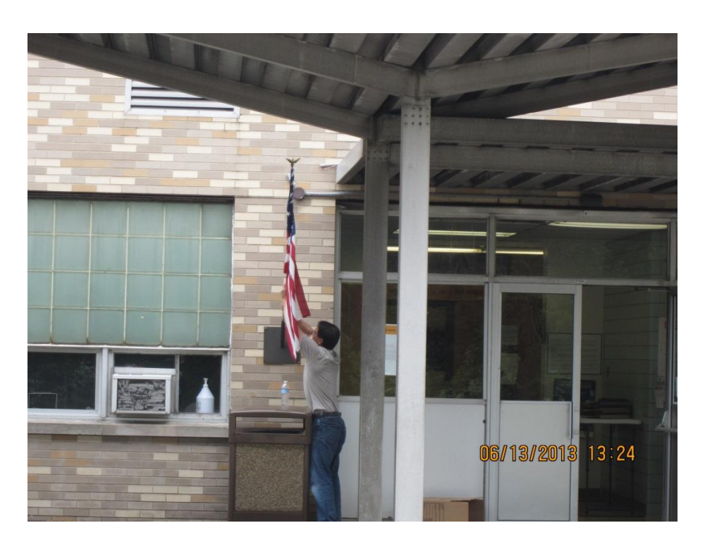
Last Flag Day